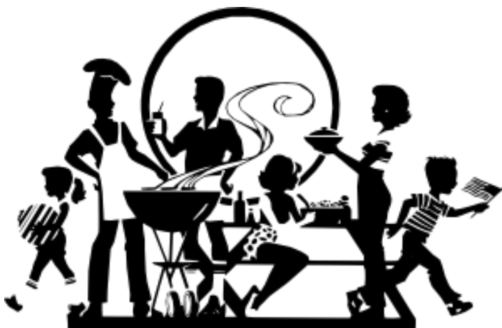
No Picnic is Complete without the Watermelon