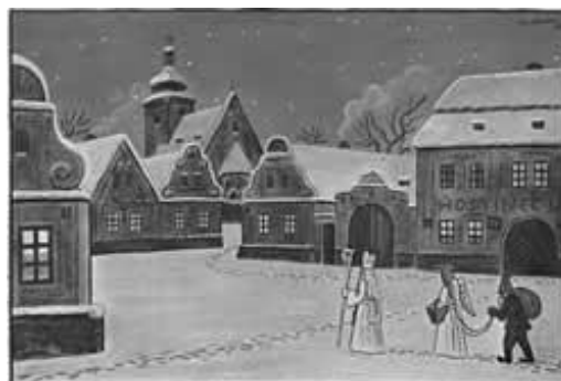
1937 Czech postcard