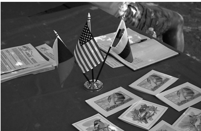
Our Identity & Cards to be Signed