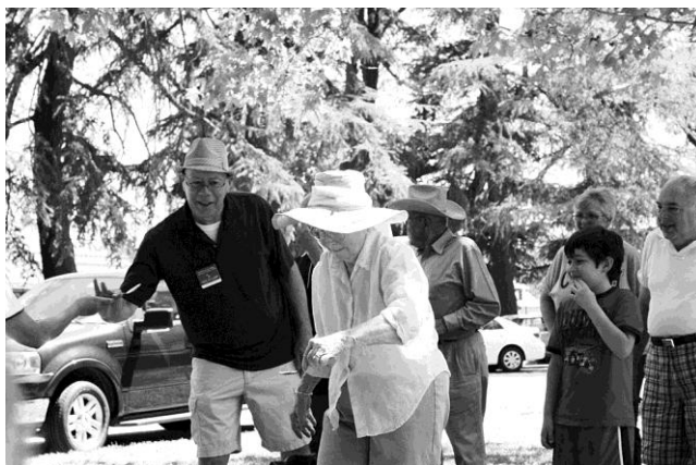
Team Water Contest: Object is to transfer water from a bucket to a glass jar using a tablespoon